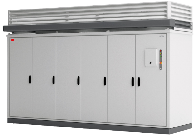
ABB central inverters ULTRA-TL OUTD 780 to 1560 kW