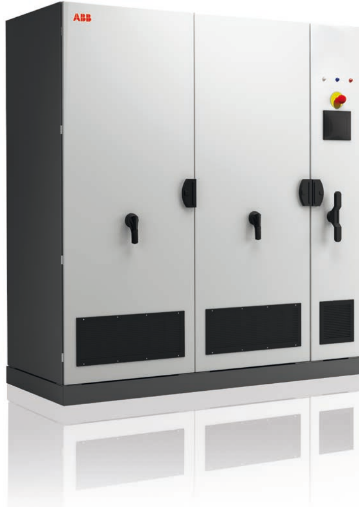
ABB central inverters PVI-500.0-CN 500 kW

This product offers high performance with affordable capital expenditure and has been specifically designed for the fast growing Chinese market.