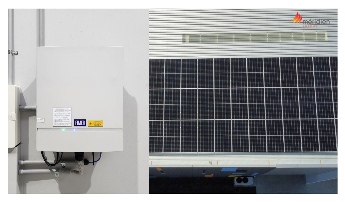
FIMER's PVS-15 three-phase inverter was installed and commissioned at a leading renewable energy company in Queensland, Australia.

Meridien Energy , a division of the Meridien Group, is a leading renewable energy specialist based in Queensland, Australia. Meridien Energy collaborates with builders and developers who are constructing new residential and commercial properties by ensuring they incorporate efficient solar systems that maximise their solar potential by designing, installing, and commissioning reliable solar solutions that guarantee quality and long-term performance for property owners.